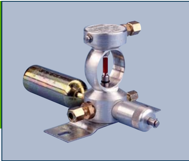
SHE release device

ESSMANN® Emergency Release Station (pneumatic) ESSMANN® SHE Release Device